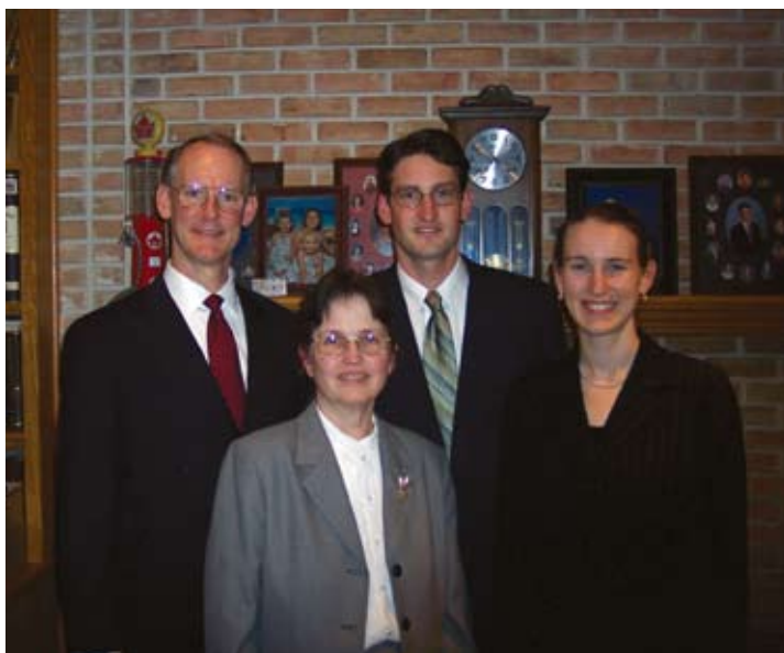
A family photo in the Packs' home in October 2006.