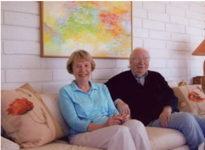
The Crows at home in Dana Point, California.