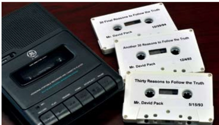
Top, the initial list of doctrinal changes in WCG (foreground) that became the book There Came a Falling Away . Bottom, the “90 Reasons” sermon series. These sermons helped thousands leave the apostasy in WCG.