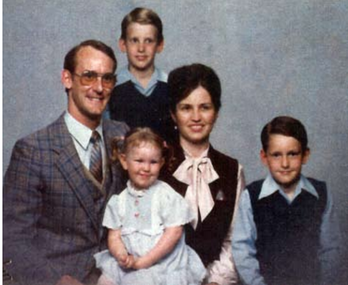
A family portrait of the now five Packs in the summer of 1981.