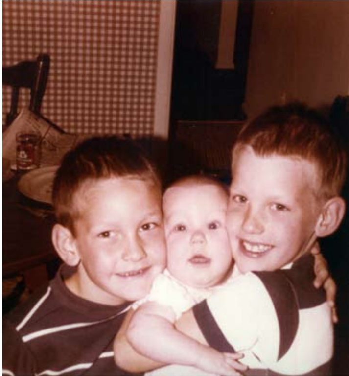
The Pack children as a “sandwich” in late 1980.