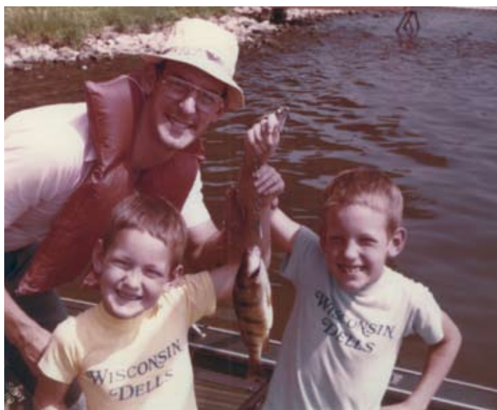
Top, fishing for perch on Lake Oneida, north of Syracuse, NY, 1979. Bottom, salmon fishing near Buffalo, NY, in 1981.