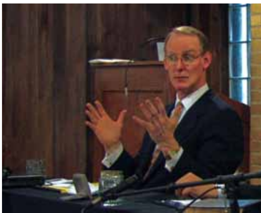
The Pastor General visits youth at the 2008 Ambassador Youth Camp (AYC). Top, delivering a sermon to young people in the Church during the final Sabbath of camp. Bottom, at a Question and Answer session earlier in the camp.