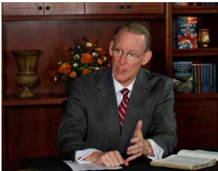
Top, delivering a broadcast in the renovated World to Come television studio. Bottom, behind the scenes of the broadcast.