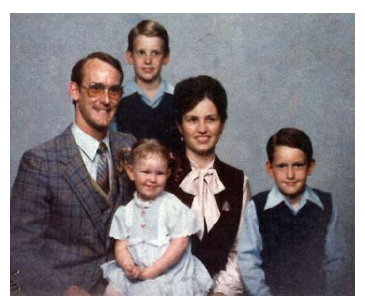
A family portrait of the now five Packs in the summer of 1981.