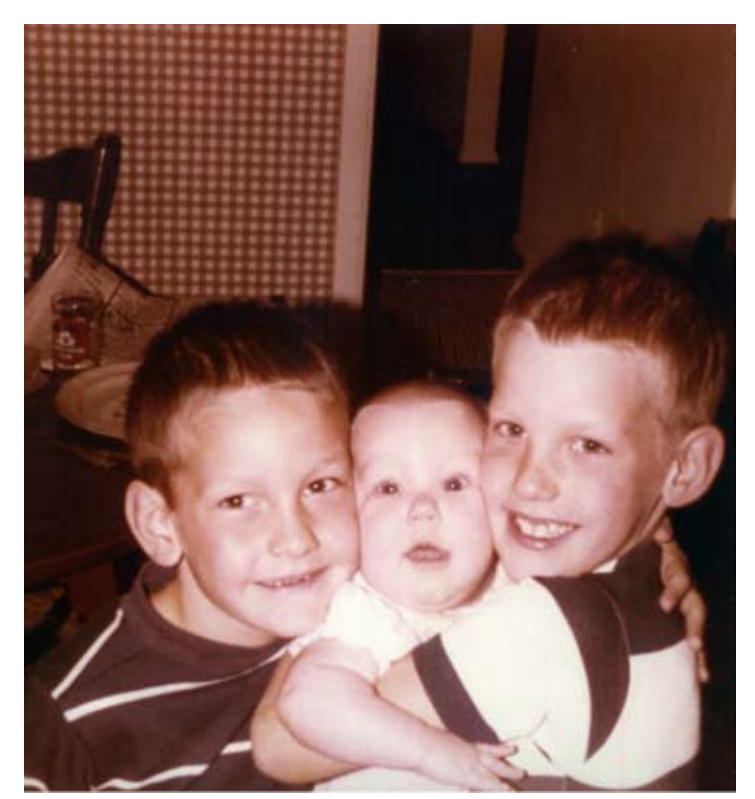
The Pack children as a "sandwich" in late 1980.