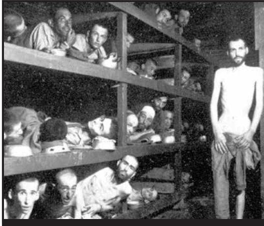
April 16, 1945, Germany: Slave laborers in the Buchenwald concentration camp.