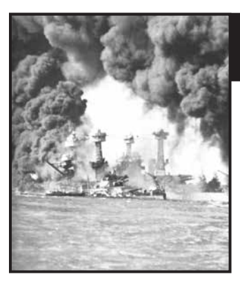
Dec. 7, 1941, Pearl Harbor: The U.S.S. West Virginia and U.S.S. Tennessee burn after the Japanese sneak attack.