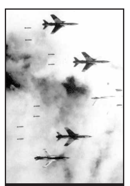
June 14, 1966: U.S. Air force jets drop bombs on a military target in North Vietnam.