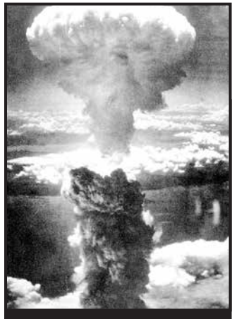
Aug. 8, 1945, Nagasaki, Japan: The second atomic bomb ever used in warfare is dropped.