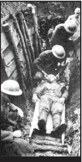
March 22, 1918: Marine receives first aid before being sent to hospital at rear of trenches.