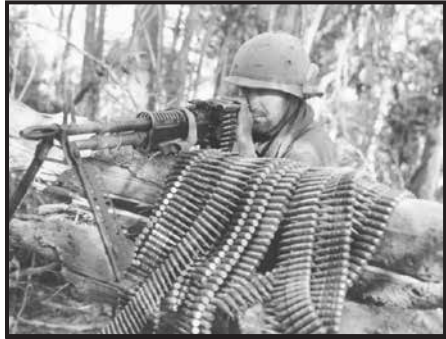
Any war: How many have died just due to the killing effectiveness of the machine gun?