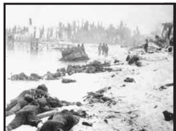
Nov. 1943, South Pacific: Bodies of dead soldiers are sprawled along the beach of Tarawa.