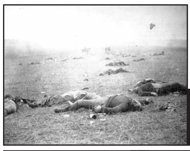
July 1863, Gettysburg: Aftermath of one of the most horrific and deadly battles of the American Civil War.