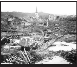
March 1945: Lunebach, Germany.